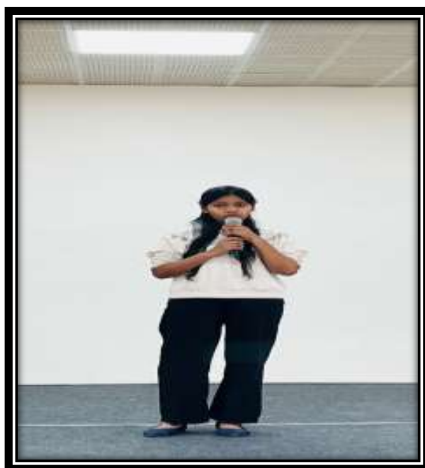
[Poetry by Students]