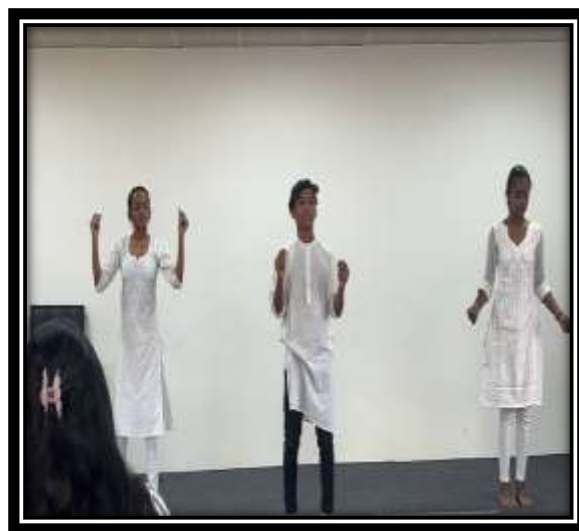
[Dance for nation]