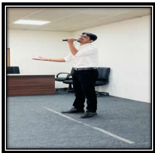
[Sing for nation]