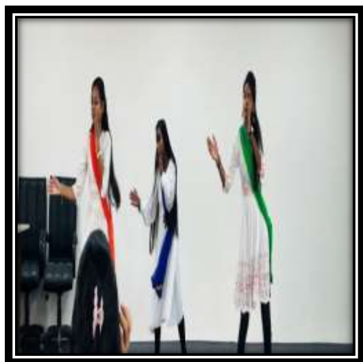
[Dance by students]