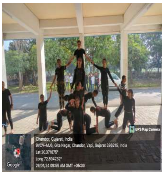
[Human Pyramid Girls]