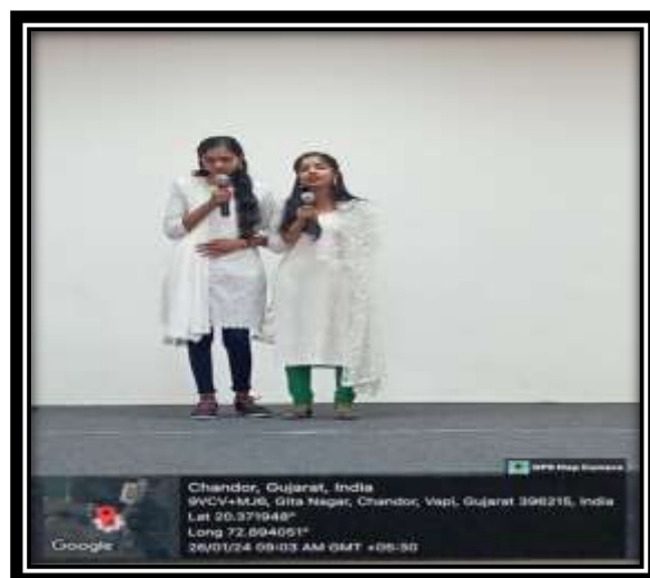
[Signing by students]